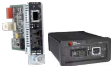
100Mbps R141 & 2141

Flexible 10Mbps and 100Mbps media, speed, and distance solutions