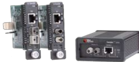
10Mbps R111 & 2111

The Ethernet and Fast Ethernet media converters by Telco Systems offer versatile speed, media, and distance to cost-effectively distribute fiber optic connections. These units provide seamless connectivity within the LAN, or between the LAN and public or private networks. These Metrobility® devices are available as a preconfigured 10Mbps unit, a selectable 10 or 100Mbps unit, or an auto-negotiating 10/100Mbps unit.